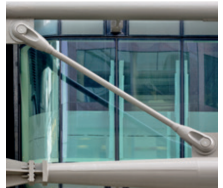
ASD0540-S tie bars M76 to M160 were used as the tension elements in the trusses to form part of this unique and structurally demanding London office building at Cannon Place.