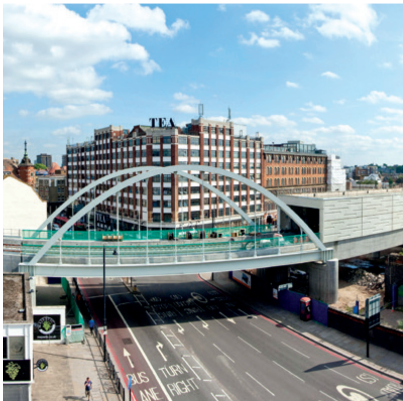
ASD0540-S M90 tie bars are used as hangers on this East London Line railway bridge in Shoreditch. As well as undergoing rigorous QA the system was also fatigue tested to 2m cycles.