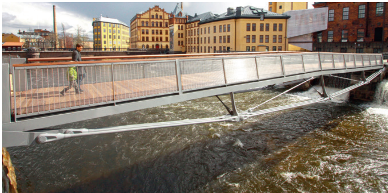
ASD0540-S M56 tie bars were used to form the tension elements for this bowstring truss Kåkenhus footbridge in Norrköping, Sweden.