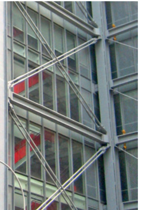
Tandem ASD0540-S bars were used to brace the new 52 floor headquarters for the New York Times newspaper.